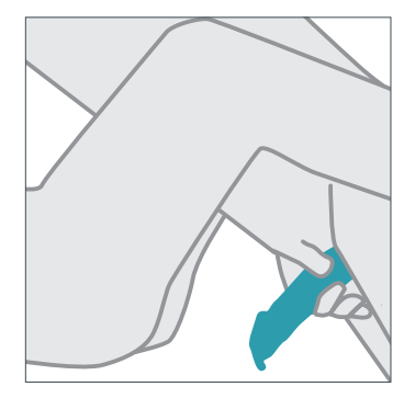
After sex but before pulling out, hold the condom at the base. Then pull out, while holding the condom in place.